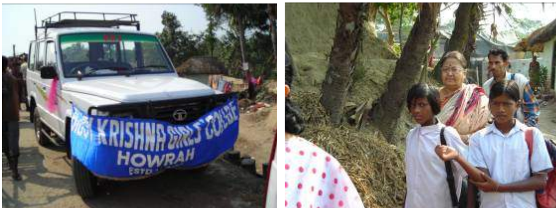
Visit to Amta Zilla Girls' School for Scientific Awareness programme