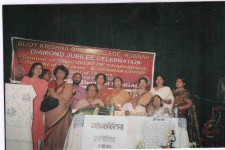
“Discovery of Charyapada in the Light of Hundred years and Russiar Chithi”