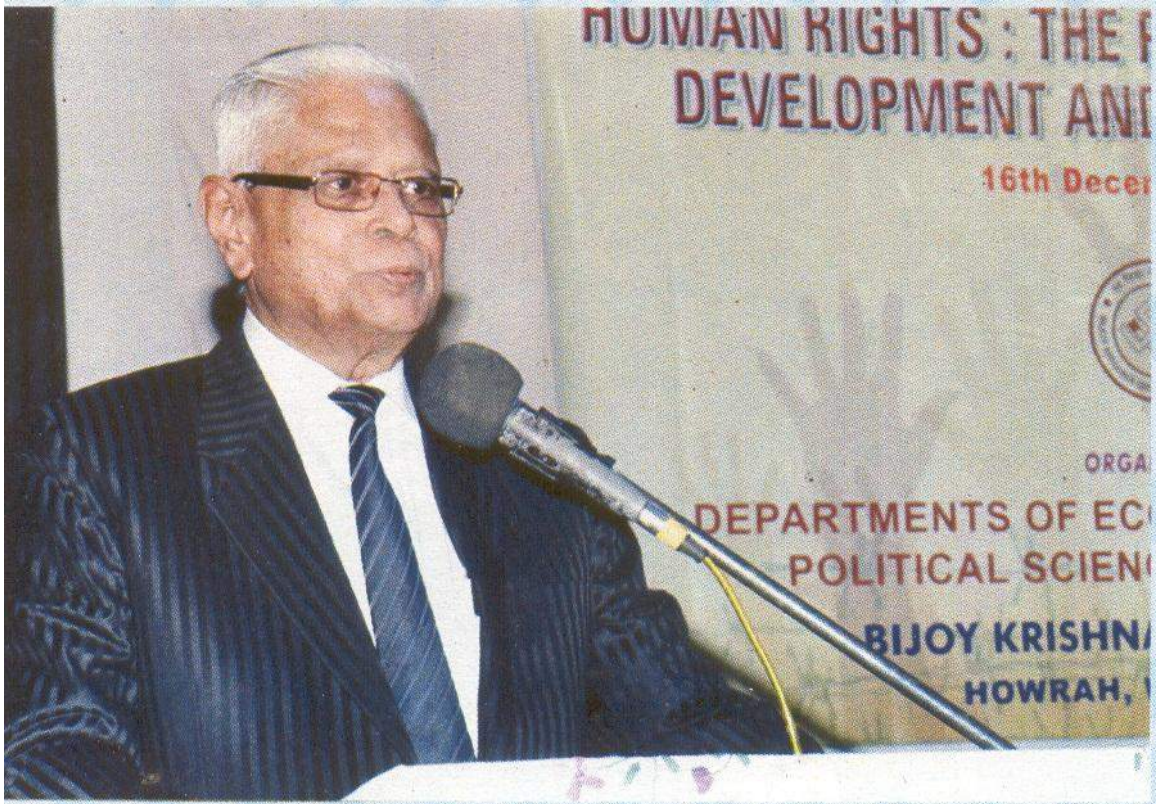
An engaging talk on Human Rights