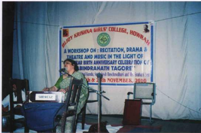
A Workshop on Recitation, Drama, Theatre and Music in the light of 150 th year Birth anniversary Celebration of Rabindranath tagore.